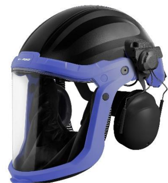
Optional Earmuffs for T-Air®Helmet