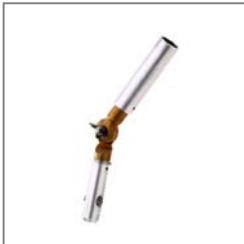
1002981 GO 100 Jiraf connector