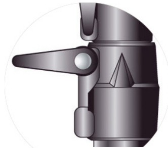
Mechanism of locking by control lever