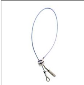
1002977 Jiraf anchorage Sling