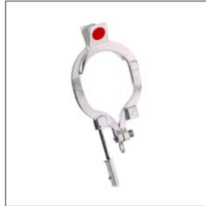
1002899 Connector Crochevit Jiraf : 150 mm